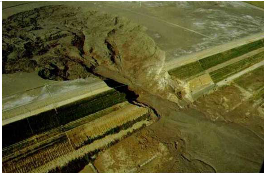
Aznalcóllar, Spain tailings dam rupture, April 25, 1998

If mine structures are built to withstand a large earthquake on a fault 18 miles away, when in fact the fault lies closer, the shaking forces experienced by mine structures will be much greater than planned for. Because some mine facilities, including tailings dams, must last forever, regulatory agencies should require that the most conservative assumptions be used in mine designs. To date the earthquake analysis and predictions by PLP do not meet these criteria.