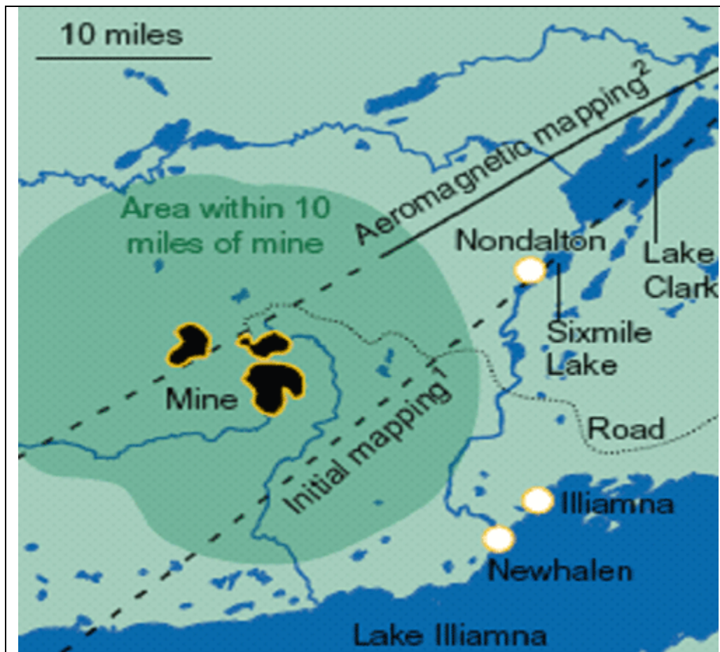
Figure 4. Geophysical locations of Lake Clark fault. Initial mapping of the Lake Clark fault estimates the fault to be within 10 miles. Aeromagnetic methods shows the fault a few miles to the north of the mine. In either case the fault is likely closer than 18 miles, the distance PLP assumes in its hazard calculations.

location of the Lake Clark fault relative to Pebble is unknown. Two USGS publications differ in where they map the fault, but both suggest it may run within 5 miles of Pebble, yet PLP claims the fault is 18 miles away (Figures 3 and 4).