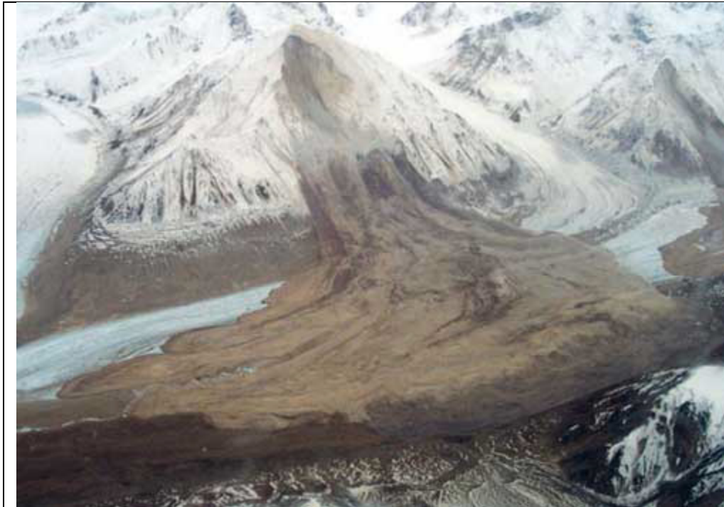
Figure 2. Landslide triggered by the 2002 Denali quake. http://pubs.usgs.gov/fs/2003/fs014-03/

Earthquakes can cause impacts far from their source. For example, the Denali quake ruptured surfaces over 200 miles, triggered thousands of landslides (Figure 2), caused 22 foot wide rifts, damaged an airport 40 miles away and caused shocks 2,000 miles away.